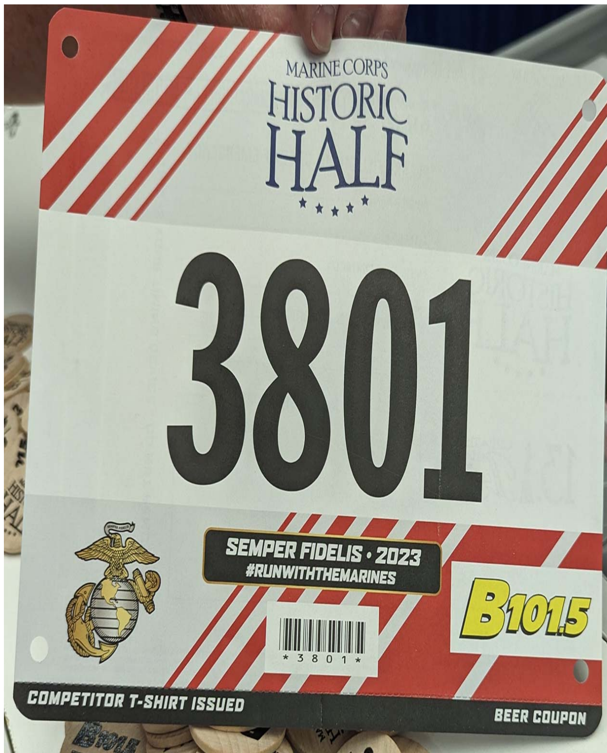
Marine Corps Historic Half Bib