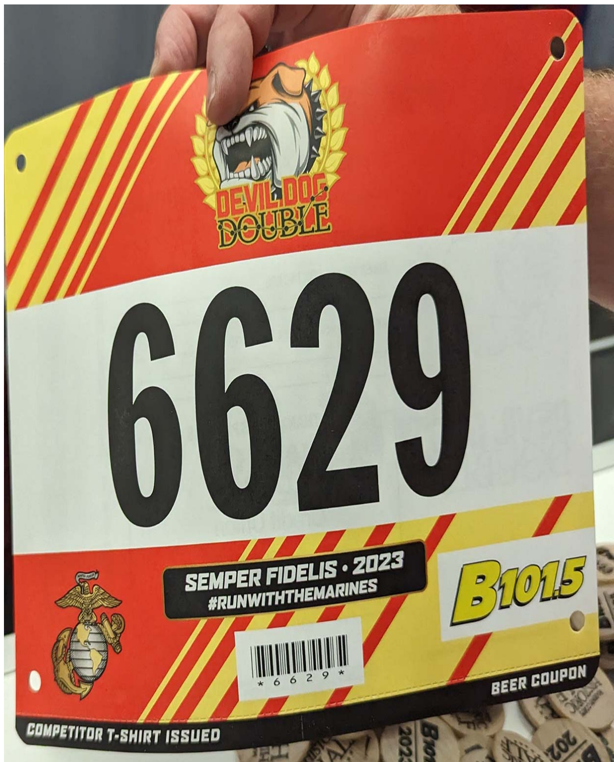
Devil Dog Double Bib