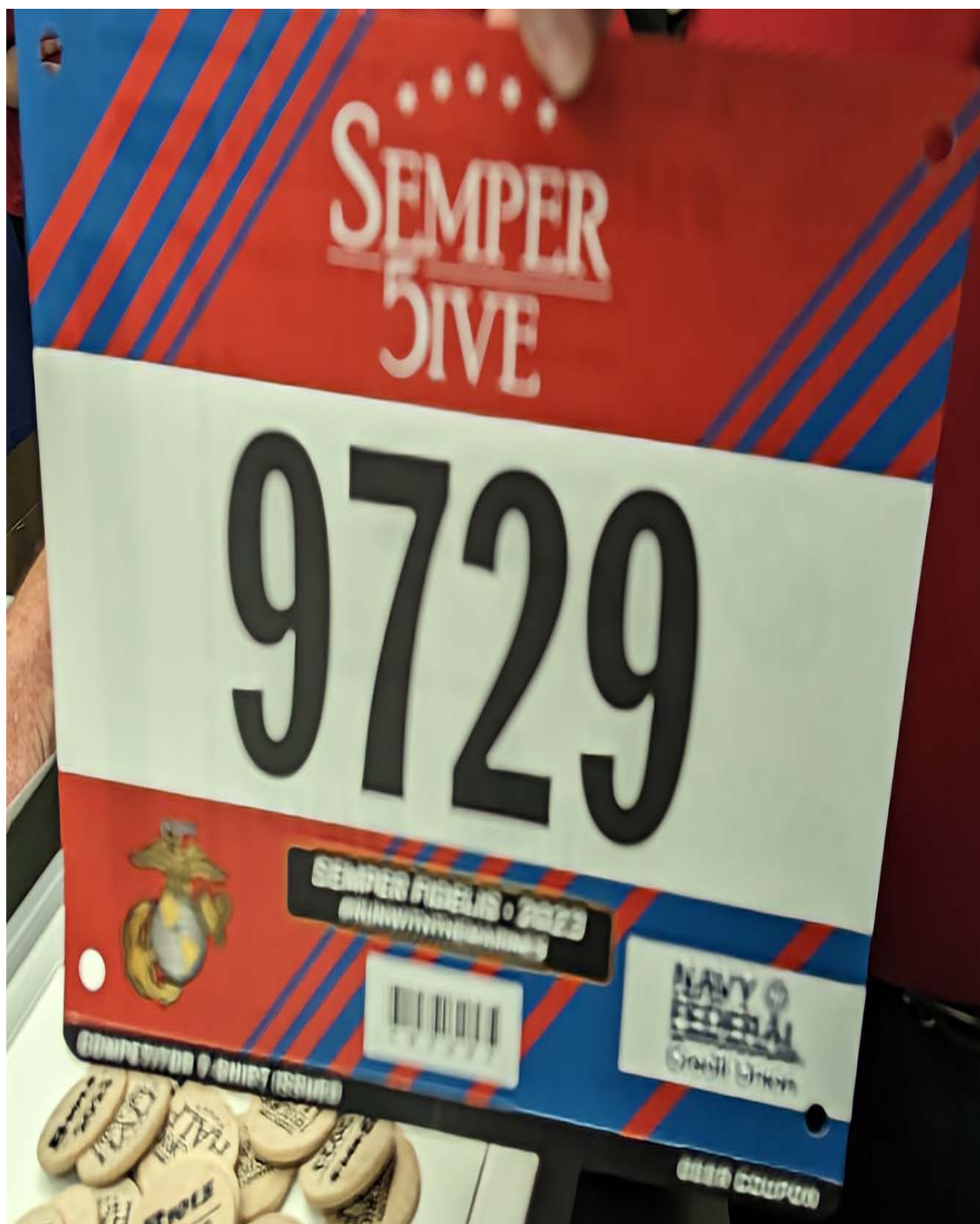
Semper 5 Bib